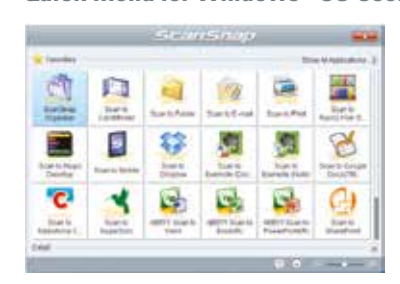
Quick Menu for Mac OS Users