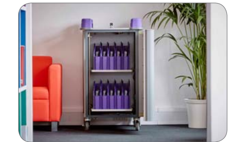
LapCabby Mini 20V