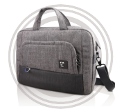
Lenovo 15.6" NAVA On-trend Toploader

* Example of Lenovo IdeaPad catalogue naming convention