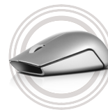
Lenovo 500 Wireless Mouse