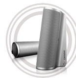
Lenovo 500 2.0 Bluetooth® Speaker